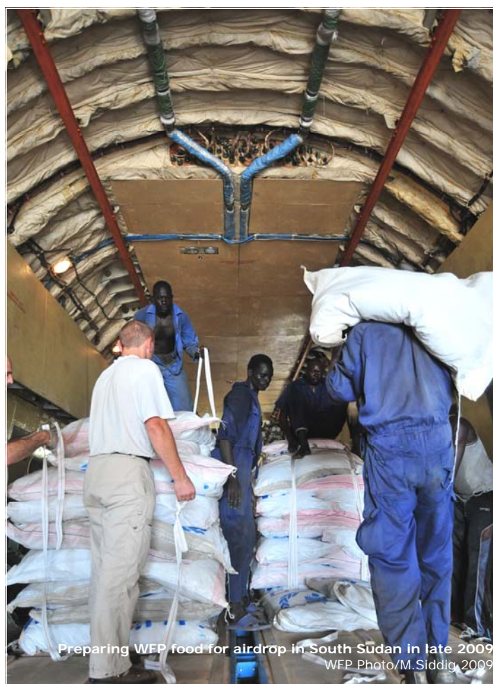
Preparing WFP food for airdrop in South Sudan in late 2009

Dispatches to the Central, Eastern and Three Areas (CETA) totaled 3,922 mt, slightly exceeding the planned target for January. Unavailability of non-emergency cereals was a main constraint.