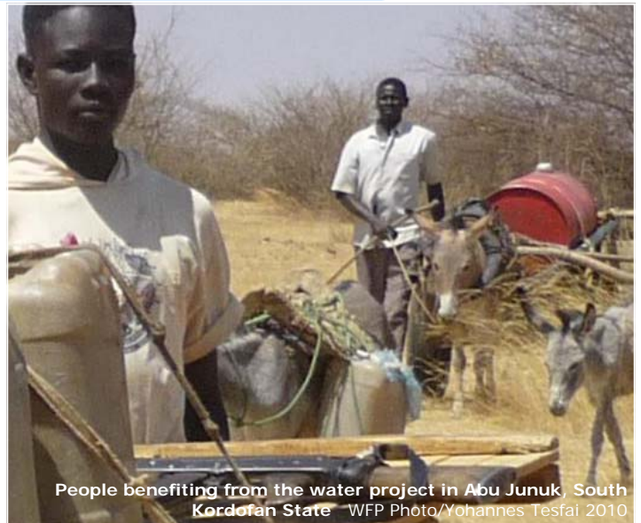
People benefiting from the water project in Abu Junuk, South Kordofan State

There is a high risk that approximately 500,000 beneficiaries in CETA areas, namely North Kordofan, White Nile, Red Sea and Kassala states, will not be receiving food assistance as of April 2010. Of the total, almost 300,000 are schoolchildren. This is mainly due to inadequate resourcing and the increased needs to cover the emergency situation in Southern Sudan and other parts of the country.