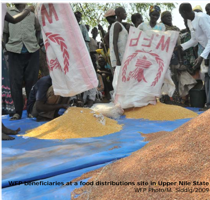
WFP beneficiaries at a food distributions site in Upper Nile State

In January, WFP and its partners reached some 231,000 beneficiaries with 4,100 mt of food commodities. Of the total beneficiaries, 8,000 LRA-affected refugees and internally displaced persons (IDPs) in Western and Central Equatoria were assisted with 130 mt of food. Compared to last year, food distributions have doubled in terms of tonnage from 2,200 in January 2009 to over 4,100 in January 2010.