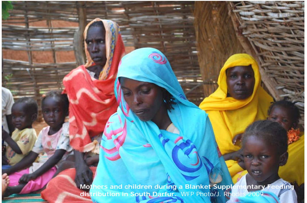
Mothers and children during a Blanket Supplementary Feeding distribution in South Darfur. WFP Photo/J. Rhodes 2009

In West Darfur, clashes between JEM and the Government of Sudan in Jabal Moon continued during the month. As a result, WFP was forced to put food distributions on hold in this area since mid-December 2009, and road missions to the northern corridor were temporarily suspended until further notice.