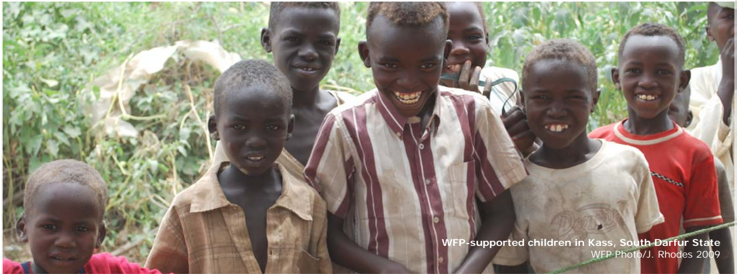
WFP-supported children in Kass, South Darfur State